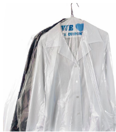
Dry cleaning bags