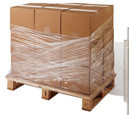
Stretch wrap & plastic wrap