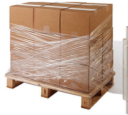
Stretch wrap & plastic wrap