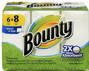
Stretchy product wrap