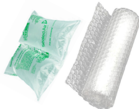
Air pillows & bubble wrap