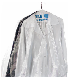
Dry cleaning bags